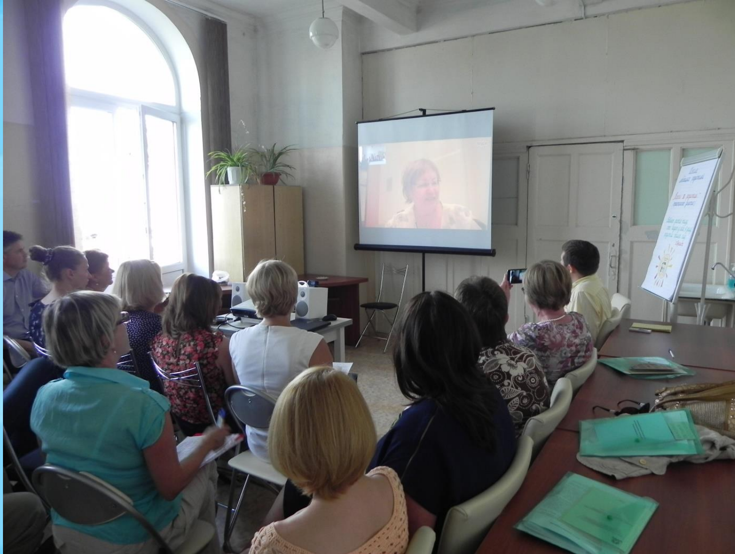
During a seminar