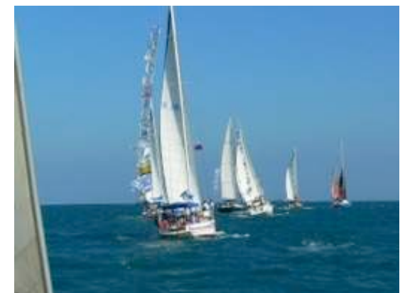
BLUE STAGE. Arkhangelsk - Solovki - Arkhangelsk