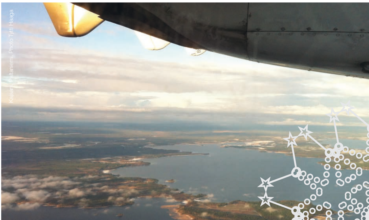
Kajani, Paltaniemi

tual traffic flows. The drafting process of the joint traffic strategies in the Barents region on both the national (BEATA) and the regional (BRWGTL) level the co-operation has flowed in an excellent manner in the past years. The Kainuu region hopes that this fluent co-operation will continue also in the future, as the actions stated in the strategies will now be put into practice.